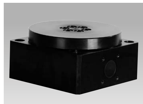
Rotating module - vertical axis DMV 1000 with flange plate Ø 170